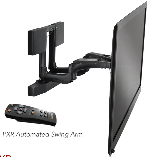
PXR Automated Swing Arm