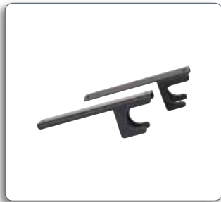
FCA100™ Power Conditioner / CAT 5 / Media Player Accessory