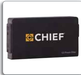
PACPC1™ Power Conditioner