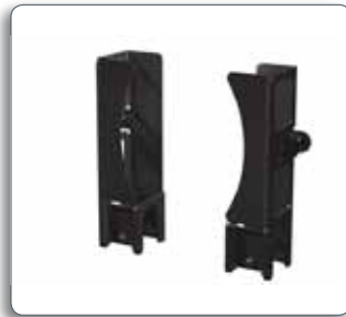
FCA102™ Secure Media Player Accessory