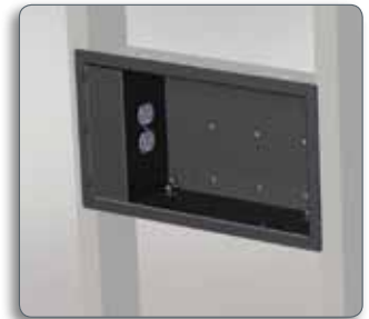
PAC521P™ In-Wall Power Box, with built-in power conditioner and surge protector