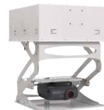
SL236 Up to 36" (914 mm) of extension