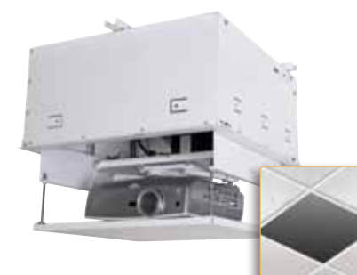
SL151 Now fits into 2' x 2' (600 x 600 mm) ceiling tile Up to 8.5" (216 mm) of extension

Get quiet, smooth extension with Chief's automated flat panel lifts to conceal displays while not in use.